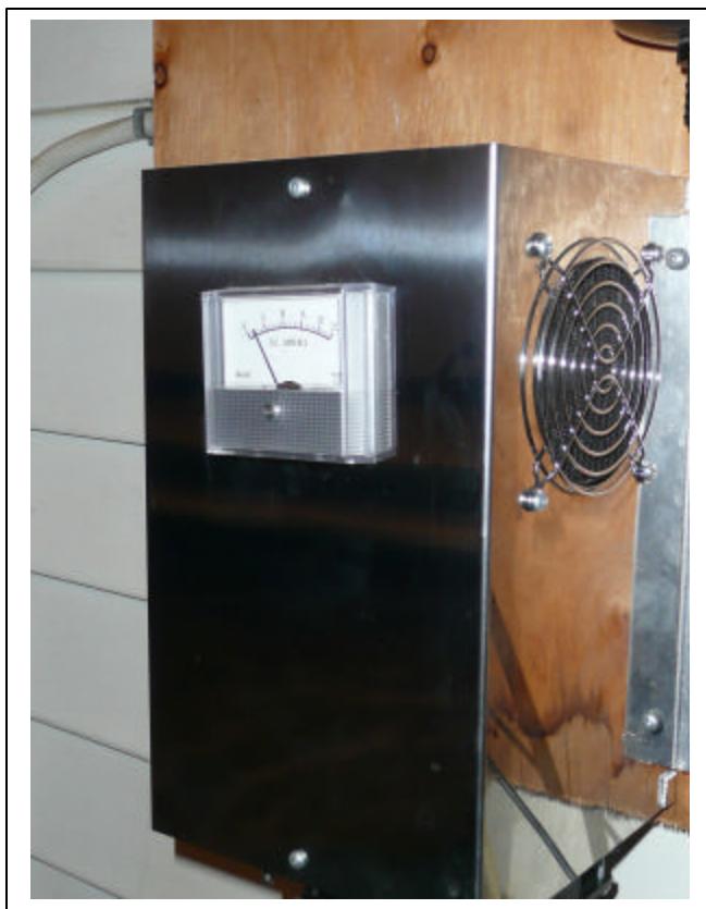
OZOPEN-TANK with power supply 24 V DC - 10 Amps