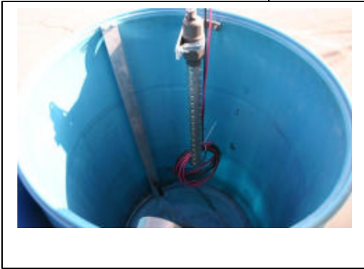
OZOPEN- Septic with power supply 48 V DC - 20 Amps