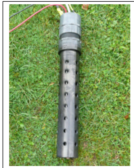
OZOPEN – Septic to be installed vertically