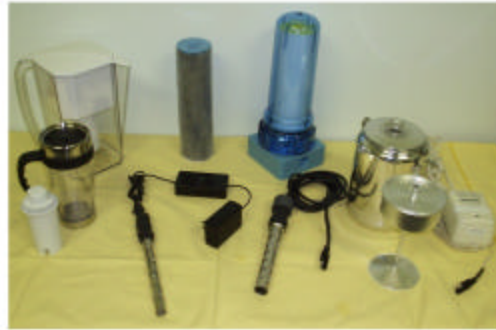
OZOPEN WITH ACCESSORIES